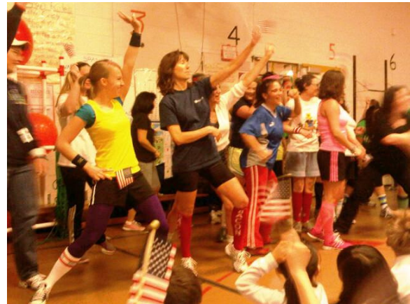
"Old School" Teachers Move Their Bodies!

Teachers and staff dressed "old school" in their 70's and 80's work out attire and displayed their commitment to physical fitness by showing off their dance moves to the song "Move Your Body" by Beyoncé. Staff have been practicing their moves for months, and their students were impressed!